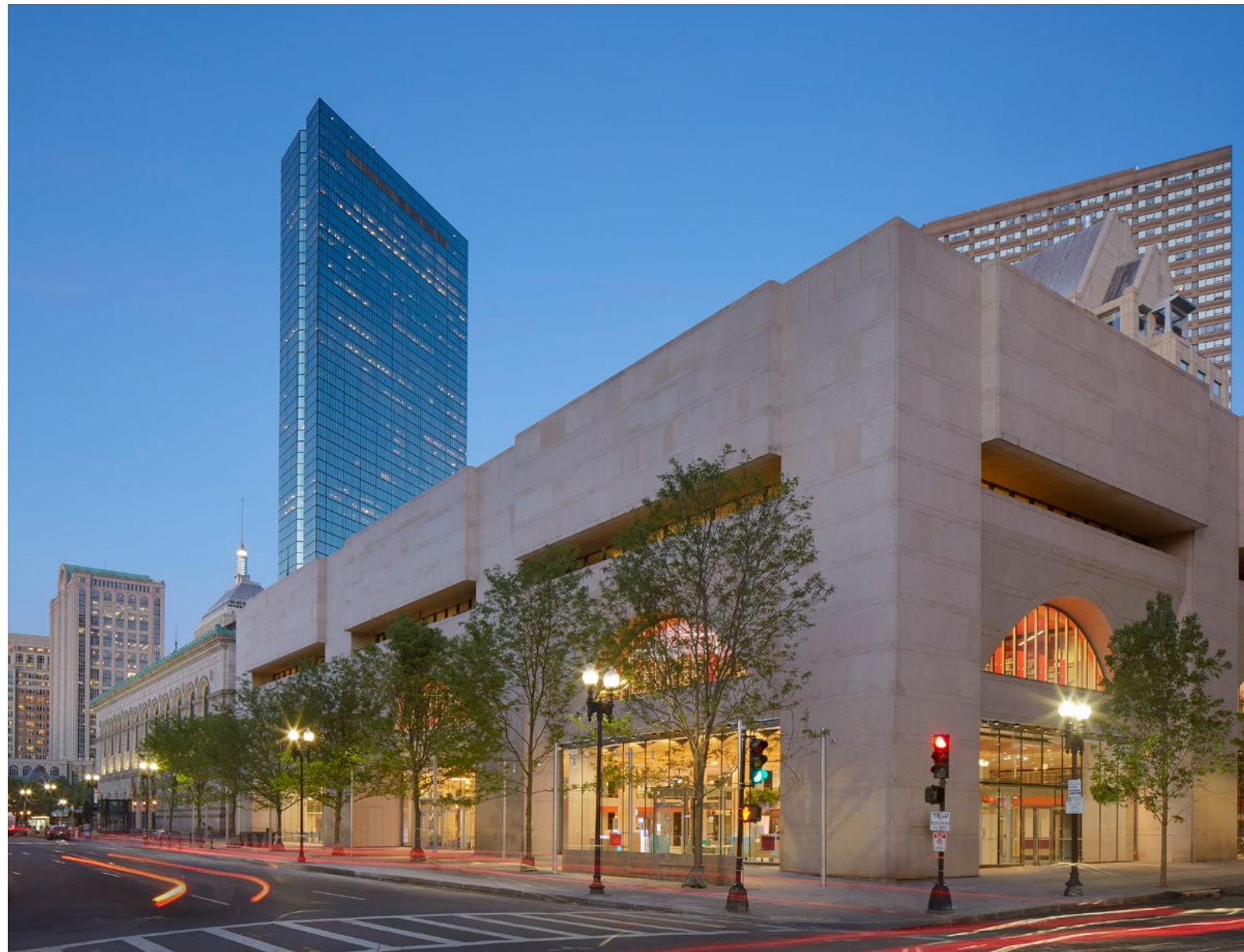
Boston Public Library - Central Branch Johnson Building Improvements Boston, MA

The Johnson Building project consists of 156,000 SF in renovations in two phases to the landmarked 1972 Phillip Johnson Addition to the Central Branch of the Boston Public Library. The BPL seeks to welcome the public, engage young patrons, and demonstrate that the library is a place for life-long learning and exploration. The renovations include the removal of the granite plinths, which currently block the ground floor windows, and replacement of the dark glazing with a visually transparent curtainwall.