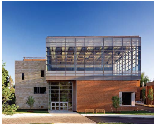
North Facade, Dance Studio in Glass