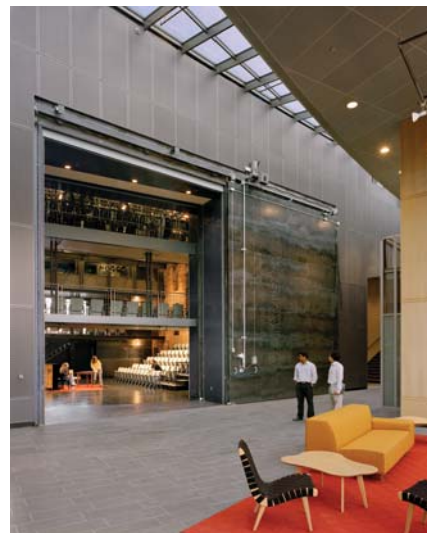
Sliding Door Opening to CenterStage Theatre