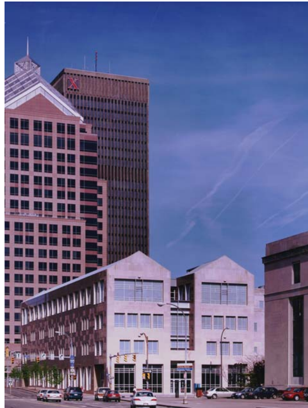
New Main Public Library, City of Rochester Rochester, NY

This new Main Public Library is located in the heart of downtown Rochester, adjacent to the new Bausch and Lomb World Headquarters. A contemporary extension to a 1930's neo-classical library, it is organized around a civic-scaled interior "street" linking the city's waterfront district with its midtown shopping district. The library's ground floor opens to Broad St. with a series of tall arched windows, allowing views into the busy Periodical Reading Area (100,000 s.f.). LaBella Associates is the Associated Architect.