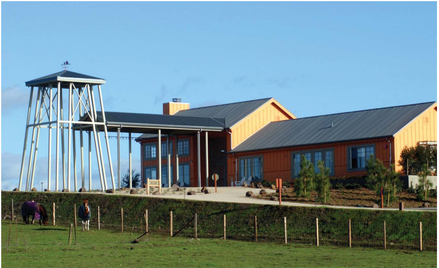
The design of the Conference Center and Hotel Units accentuate stunning views of the surrounding vineyards