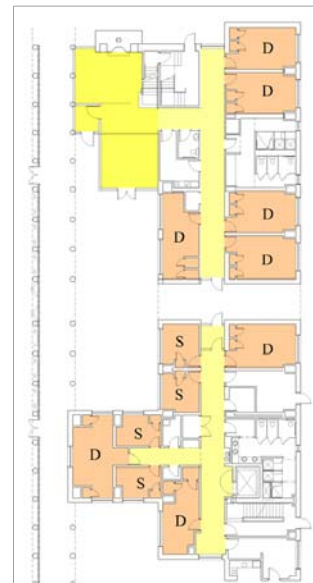
Site and building diagrams and plans.