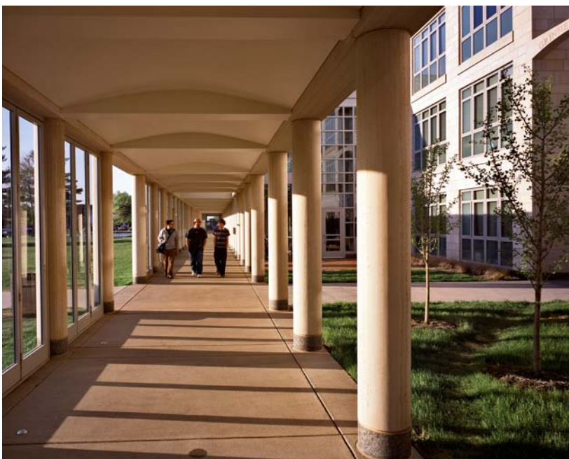
Campus and Interior Photos