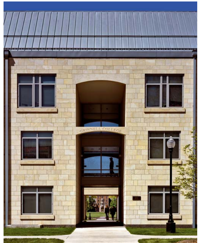
Two-story portal to the campus.