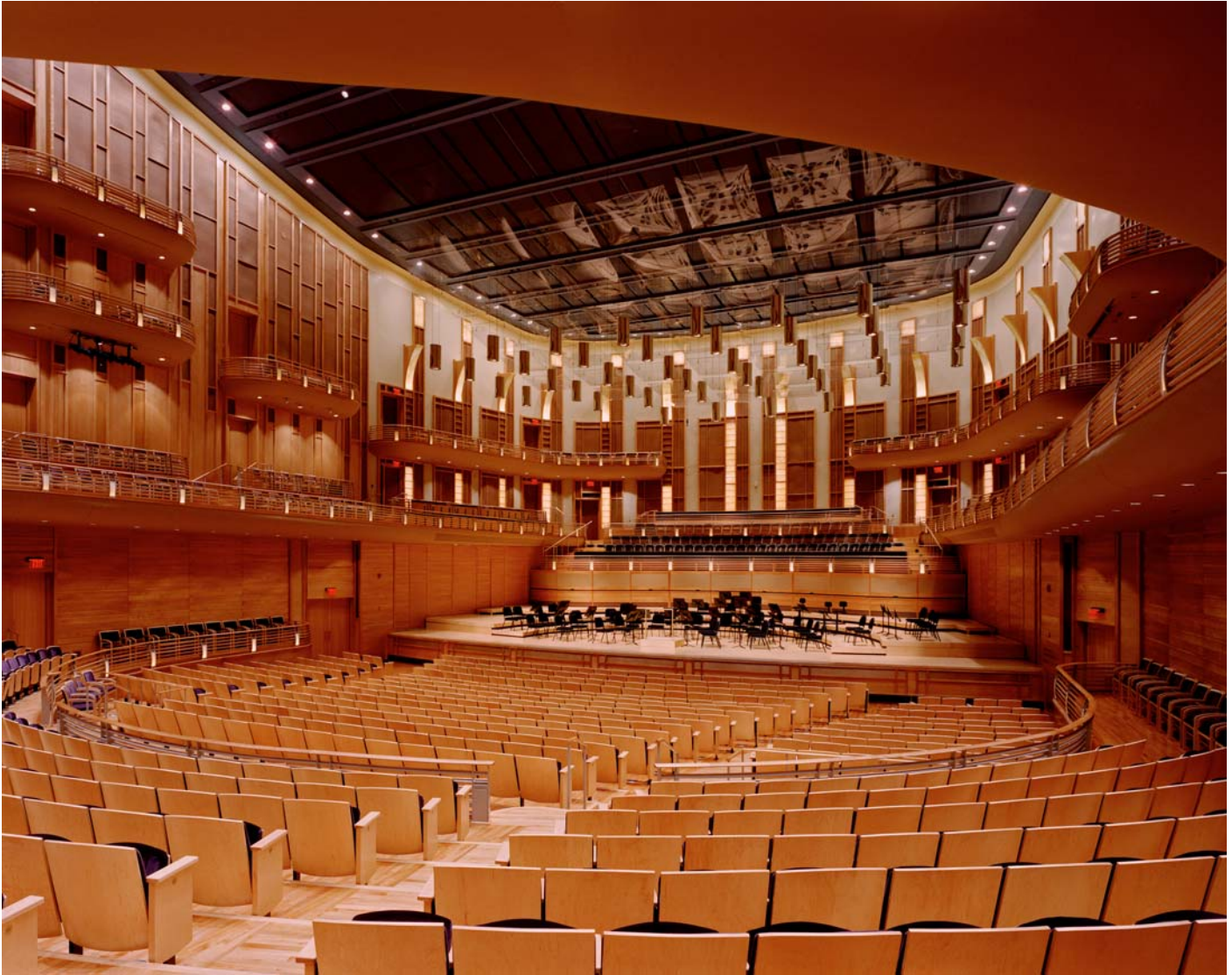
Inside the Concert Hall