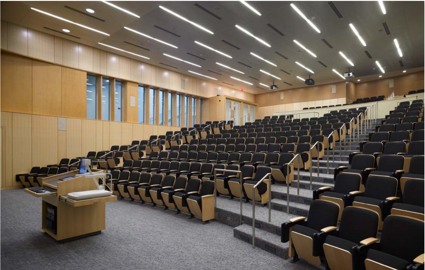
The 270-seat Media Center was designed to be used for large classes, admissions presentations, movies, and press events.

State-of-the-art technology allows these classrooms to provide a robust infrastructure that facilitates multiple setups maximizing flexibility in teaching styles in a large classroom setting.