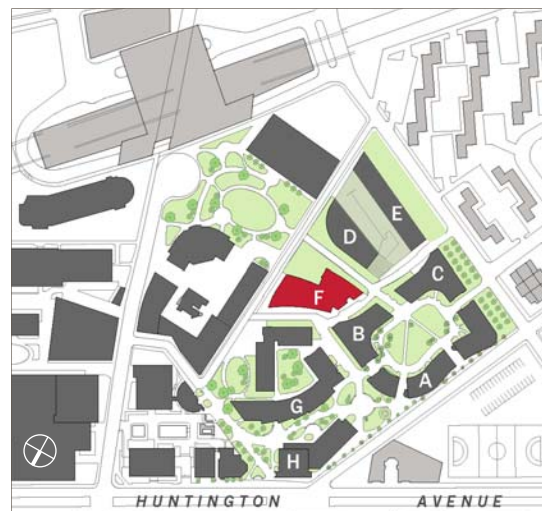
West Campus Master Plan (A-H) by William Rawn Associates, Architects, Inc.

Freshman Honors Program with Residence Hall (230 beds), Auditorium, Classrooms, and the John D. O'Bryant African-American Institute