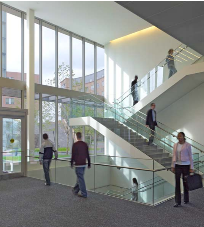
3-story Atrium opens academic center to active pedestrian promenade.