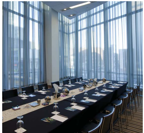
Light-filled conference rooms provide views of the City while ensuring privacy