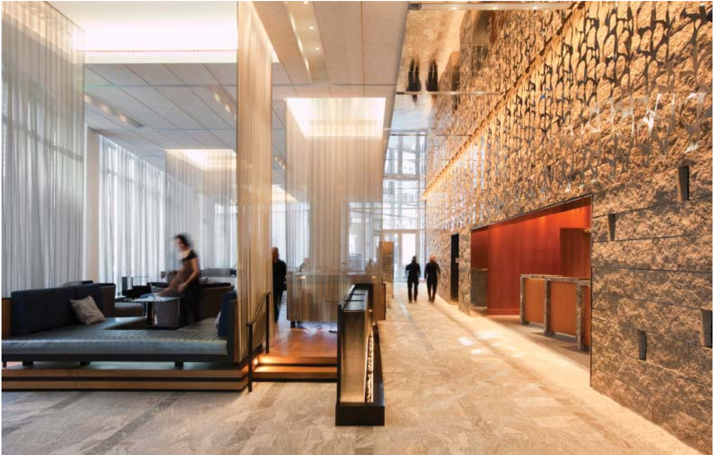
Clear glass creates a direct visual connection between the street and the check-in desks and lobby lounge