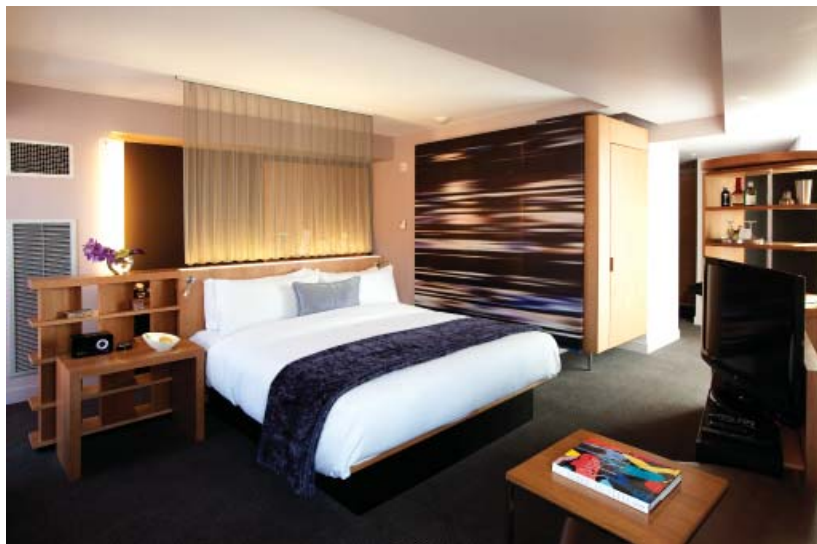
Restrained palette and furniture: Rooms and suites as urban oases overlooking cityscape